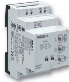
Insulation monitor RN 5897/300