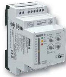
Residual current monitor RN 5883