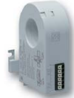
Residual current transformer ND 5015