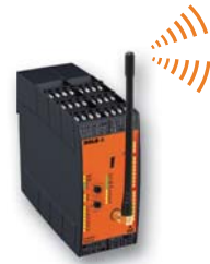
Radio controlled safety module UH 6900 Group controller