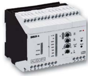
Insulation monitor LK 5896/900