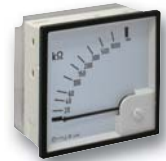
Indicating instrument RP 5898