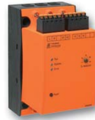
Softstarter PF 9029