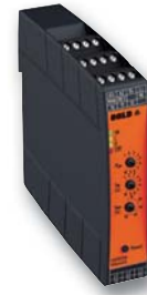
Smart motorstarter UG 9256