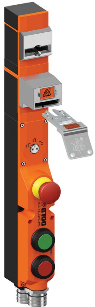
SAFEMASTER STS ZRHC Unit with key

The safety switch and key transfer system SAFEMASTER STS by Dold & Söhne meets all requirements of the current machine directive. The personal key is an integral element of the TÜV (Technical Inspection Authority) certified safety system. As opposed to LOTO the lock-in protection is not only optional but enforced in this system: Only after the personal coded key is removed can the safety gate be opened to access the hazardous area. The system also includes units into which several keys can be integrated so that several people have their own keys at their disposal.