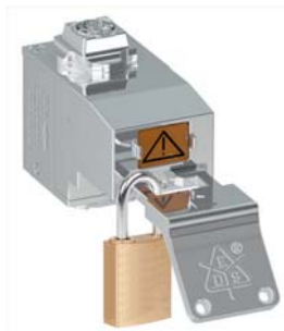
Padlock module to integrate LOTO-functions into SAFEMASTER STS system