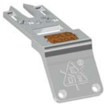
Personal key with coding

In some applications, however, escape releases cannot be realized for technical reasons because the escape release controls cannot be mounted at the danger side. These include containers, mixers, press chambers or cramped engine rooms. The personal coded key is the ideal solution as a preventive safety measure against lock-in and the restart of a machine.