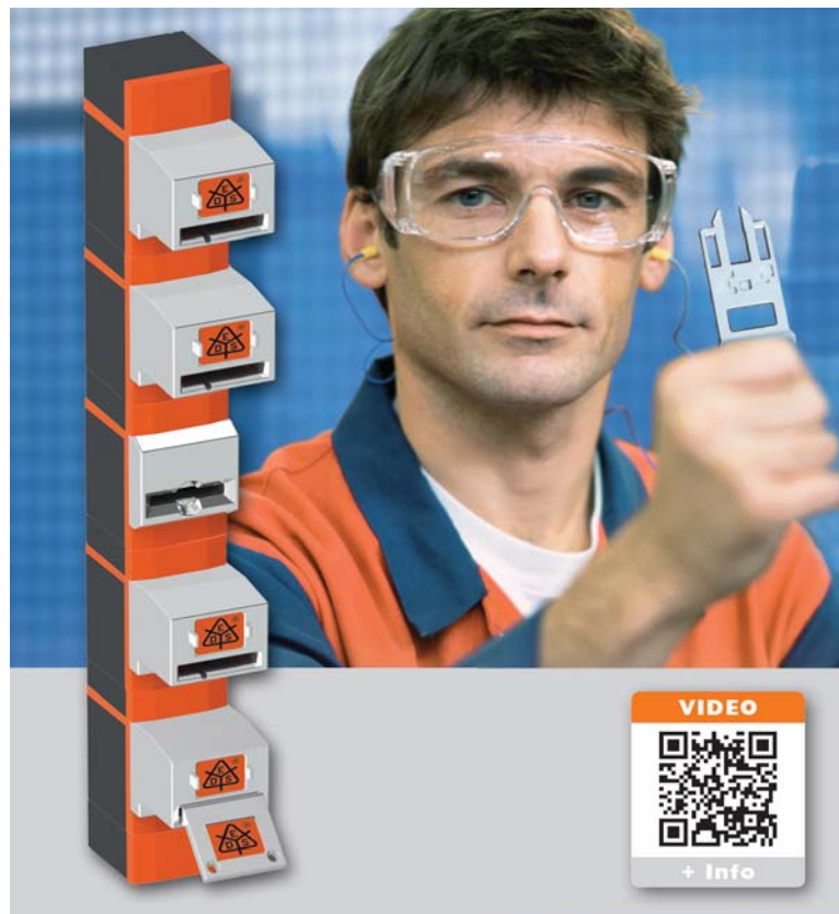
Safety switch and key transfer system SAFEMASTER STS protects from lock-in by personal coded key (with QR-code for video).

There are different ways to provide for safe escape options from hazardous areas. However, safety concepts based on preventive protective measures are preferable. In other words, the lock-in of people in the hazardous area is prevented beforehand. Furthermore, a machine start is reliably prevented as long as there are people inside. Thus, a safety system with personal keys can be considered the ideal solution in many cases.