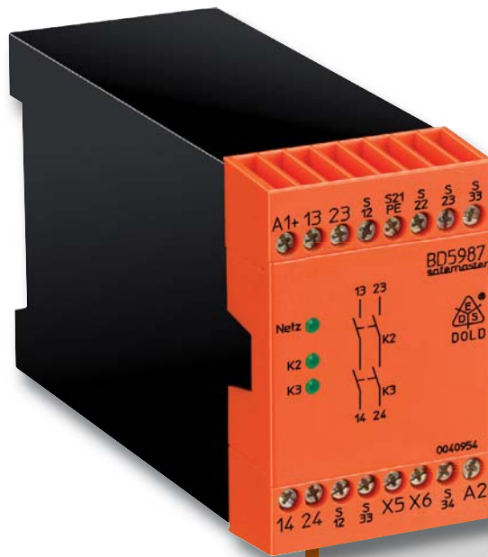
Emergency stop module BD 5987/301

Failures and accidents are prevented by the use of reliable safety relays and sensors, redundant path control systems and safety components. The use of reliable monitoring devices ensures the early detection of potentially critical conditions and indication of these conditions increases the systems availability.