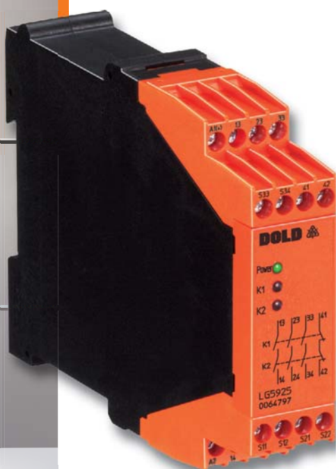
Safety module LG 5925/034