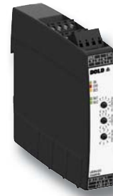
Multifunction measuring relay UG 9400