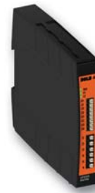
Emergency stop module UF 6925