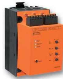
Softstarter PF 9015